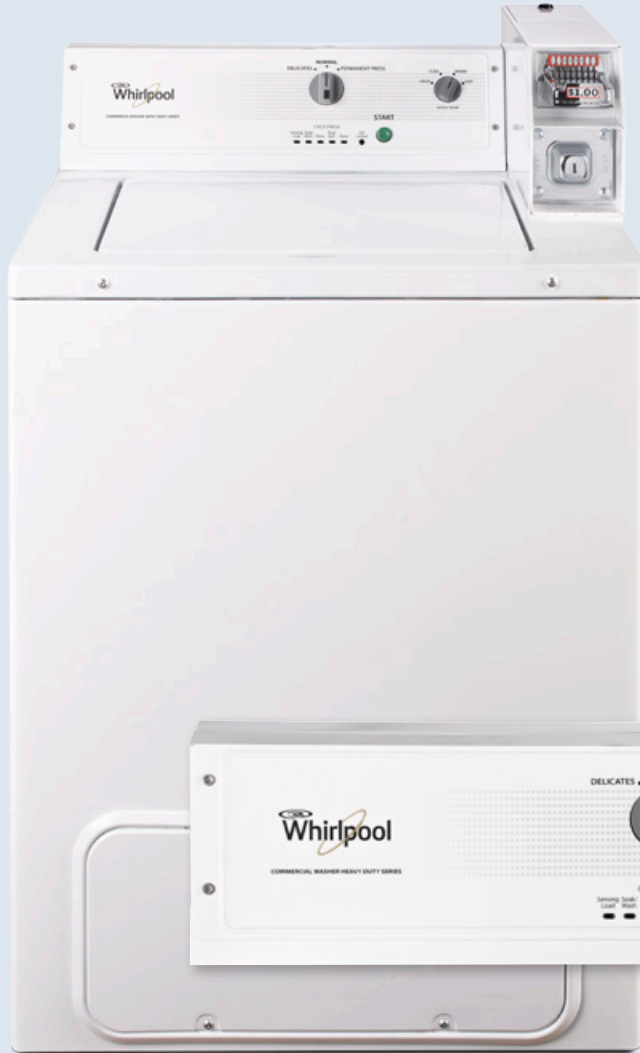
Coin slide and coin box not included.