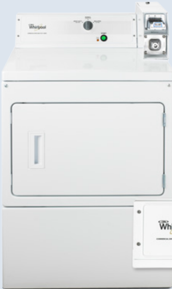
Coin slide and coin vault not included.