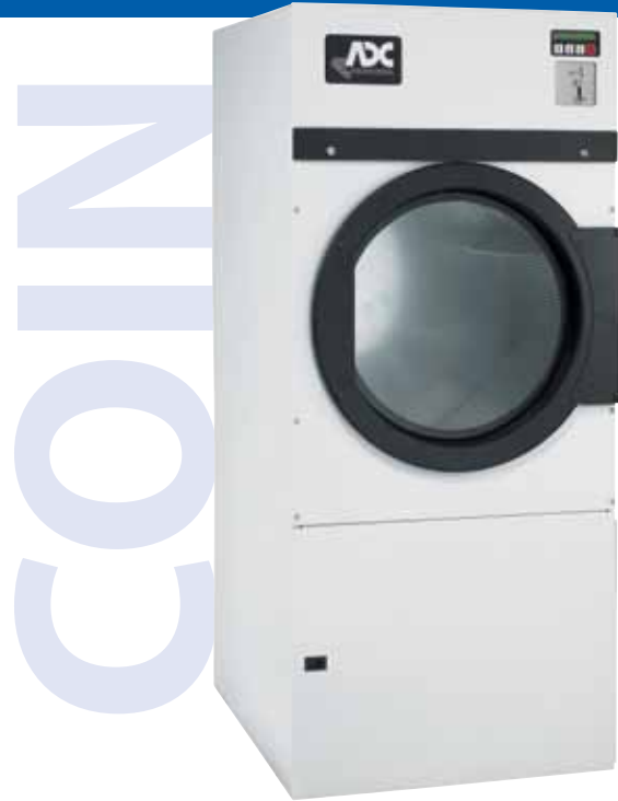
AD-24 Coin Dryer