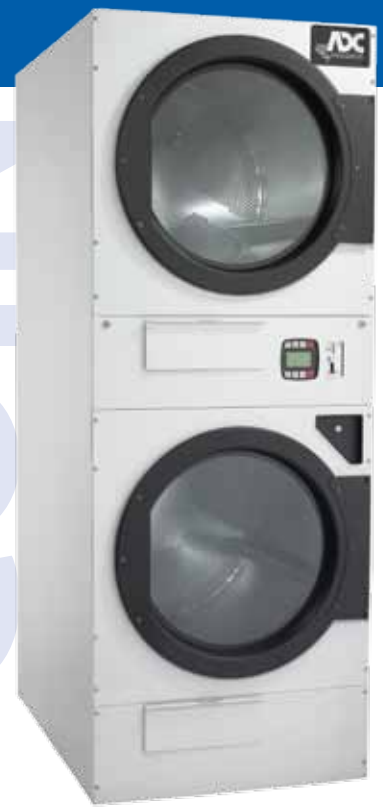
AD-320 Coin Stack Dryer