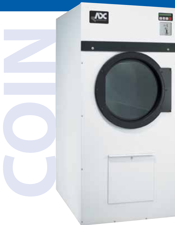
AD-50V Coin Dryer