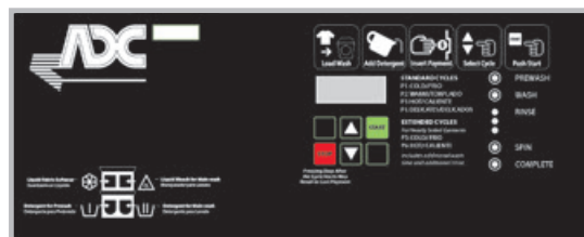
MR2 Controller—Card Ready