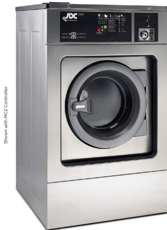
Shown with MC2 Controller